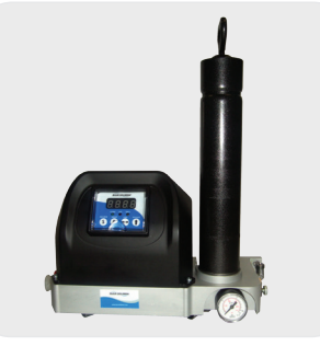
Cartridge Lube Pump

The corrosion resistant PVBM Divider Valve dispenses lubricant to as many as 20 outlet lines. This compact valve can be located near the lube points to accurately dispense grease automatically to the entire machine. Valves are available with cycle indicator pins to provide visual confirmation of system operation. In addition, the cycle pin can be fitted with a switch to provide electrical feedback to a system controller.