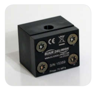
Lube Point Monitor (Part #55105)