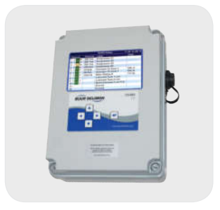
DS405 Lubrication Monitor