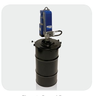
Electric Barrel Pump

Bijur Delimon's new state of the art Electric Barrel Pump's versatility is unmatched in the market today. As seen below the new EBP can operate all styles of lubrication systems and metering from progressive, injector, direct, and even dualine. Versions are also available for all standard drum sizes. Now you can standardize on one pump design throughout your plant!